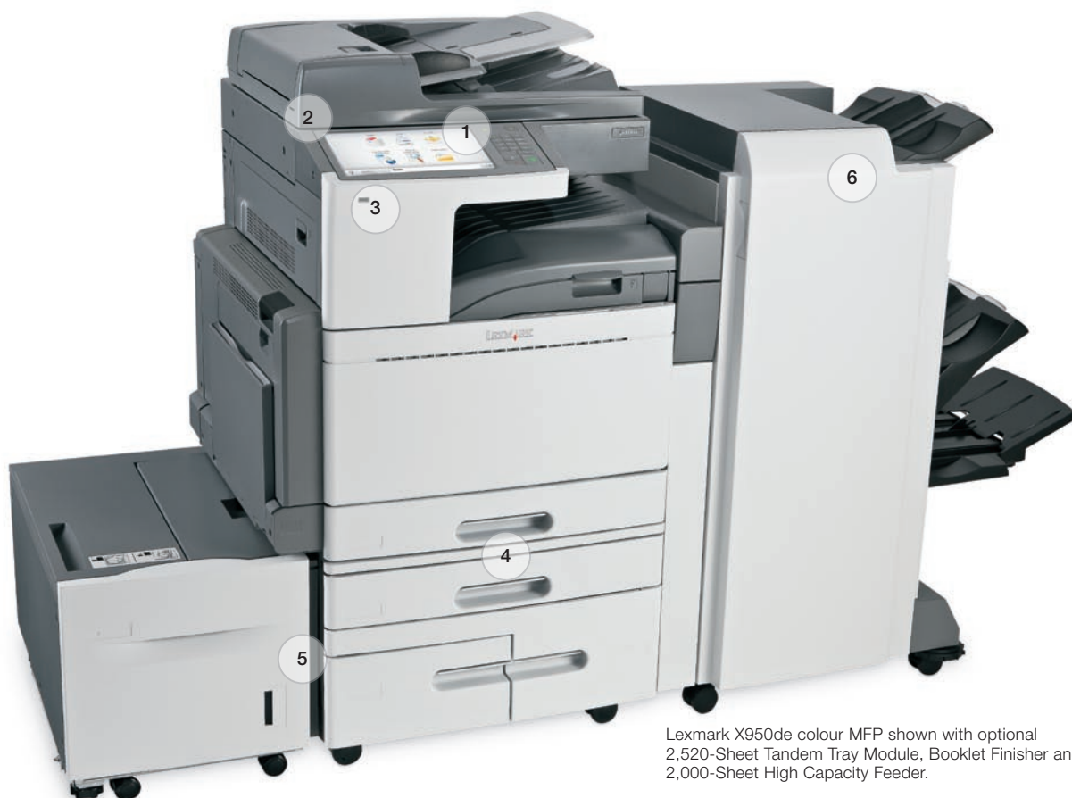
Lexmark X950de colour MFP shown with optional 2,520-Sheet Tandem Tray Module, Booklet Finisher and 2,000-Sheet High Capacity Feeder.